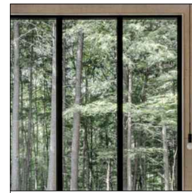
AW - ALUMINIUM FRAMED GLAZING COLOUR: BLACK