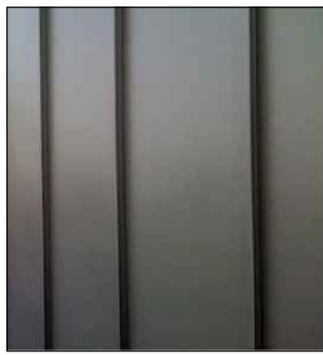
CL1 / RS STANDING SEAM METAL CLADDING COLOUR: BLACK