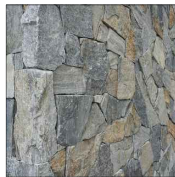
ST - STONE CLADDING