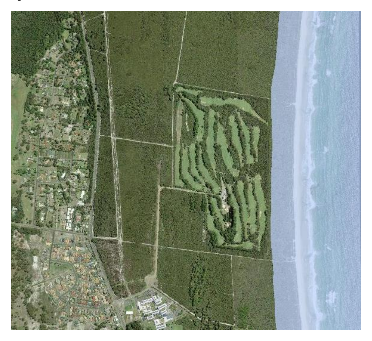
Figure 5.2 Coastal Environment Area

The Coastal Environment Area is seaward of the proposed NTURA development footprint as illustrated in Figure 5.2.