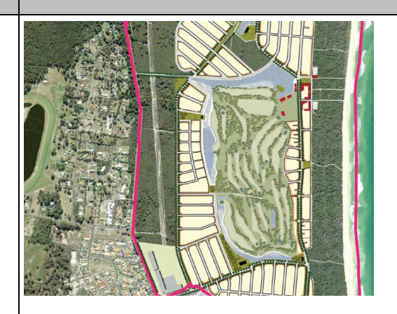
Figure 3 - Masterplan