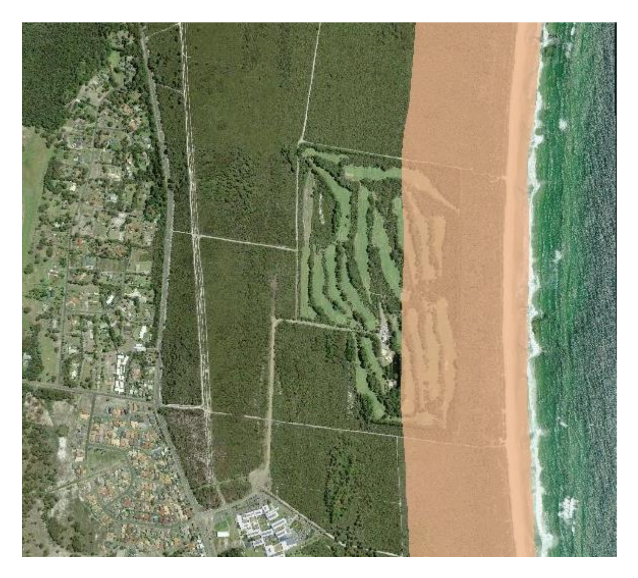
Figure 5.1 Coastal Use Area